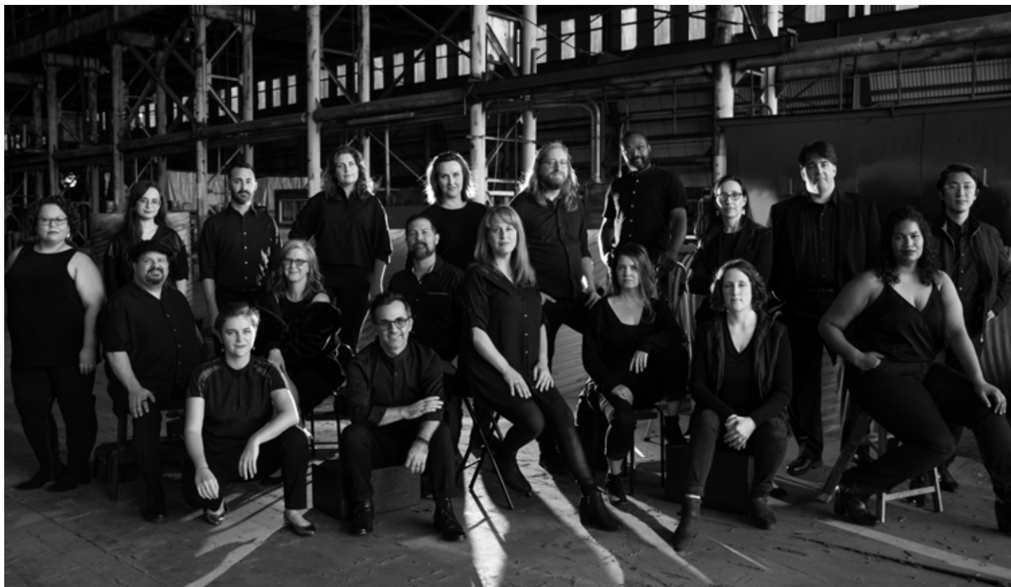
Resonance Ensemble 2022