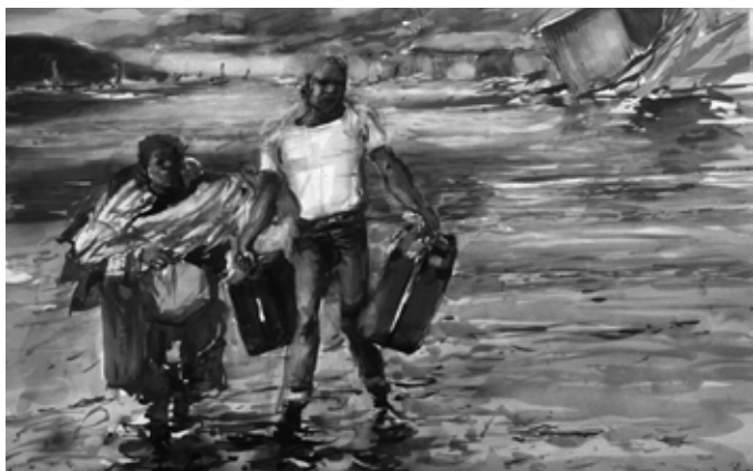
Henk Pander Painting

Setting this poem, I wanted to capture the poem's nuance of finding light without dismissing the horrors of violence, discrimination, and systemic oppression. Throughout the piece, I placed bits of the text in conversation with one another—creating a dialogue with both the hope and the pain the text depicts. While there is a forward push towards hope in the ending sections, the last moment uses a thick and ambiguous chord that draws out different sonorities over a long sustain—stripping away to a final, evasive harmony. What do you see?