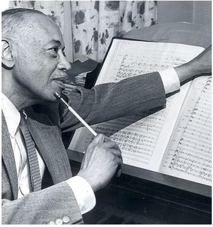
William Grant Still

Mourning angel silence your wailing And raise your head from your hands Weeping angel on your pinions trailing The white dove, promise, stands! —LeRoy V. Brant